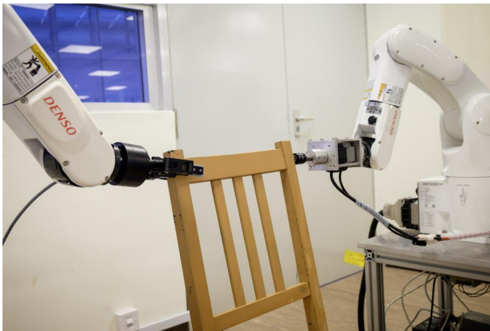
Robots assemble an Ikea chair at Nanyang Technological University (NTU) in Singapore April 17, 2018. Picture taken April 17, 2018.